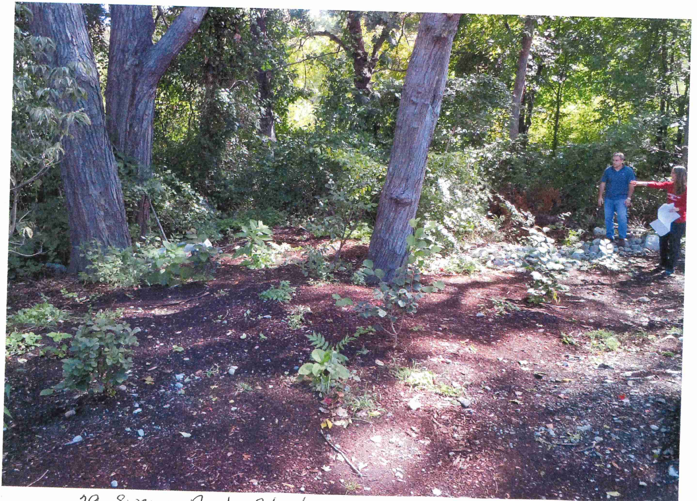
39 Swains Pond 9/20/2012