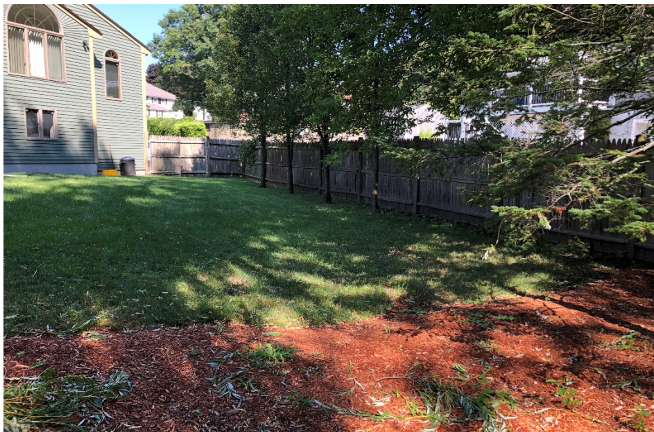
Rear yard with trees planted by the Turners