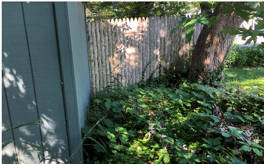
Rear of shed