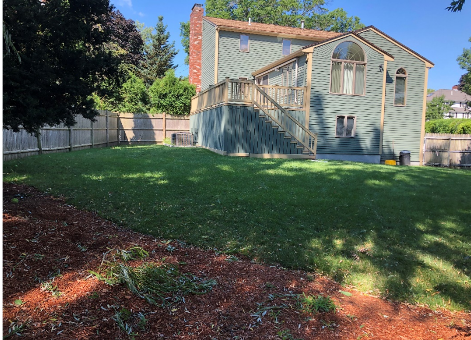
Addition and deck

Civil Engineers, Land Planners and Land Surveyors