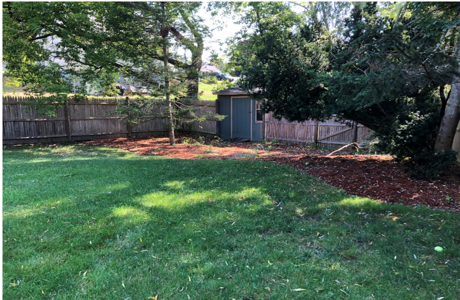
Shed and rear yard