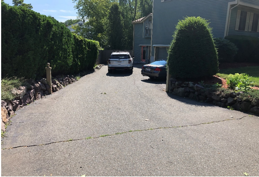
Driveway from Sycamore Road

Civil Engineers, Land Planners and Land Surveyors