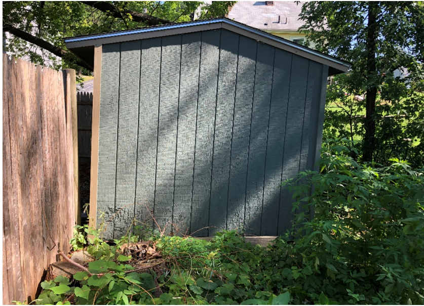
Side view of the shed

Civil Engineers, Land Planners and Land Surveyors