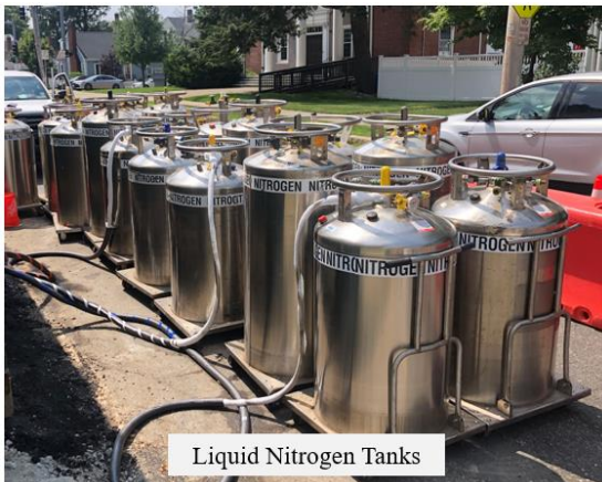
Liquid Nitrogen Tanks