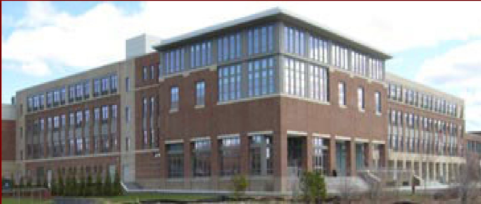
Melrose Veterans Memorial Middle School